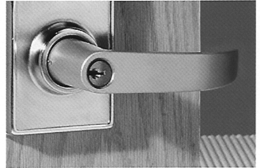
Regal Handle Trim